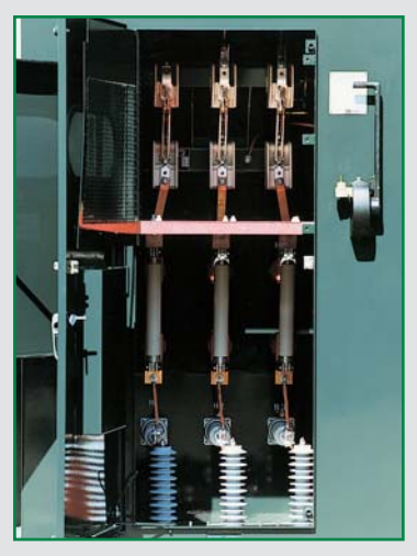
High voltage loadbreak switch compartment