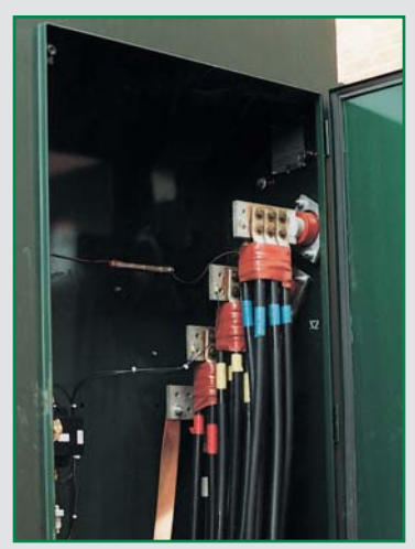
Low voltage compartment

IONEER TRANSFORMERS MANUFACTURE LOW PROFILE, TAMPER PROOF, TOTALLY INTEGRATED PAD-MOUNTED MINI SUB-STATIONS, CALLED UNITIZED PAD-MOUNTS. THESE UNITS ARE USED AT COMMERCIAL SITES SUCH AS APARTMENT COMPLEXES, SHOPPING CENTERS, OFFICE COMPLEXES, INDUSTRIAL PARKS, FACTORIES, AIRPORTS, HOSPITALS, ETC. THE UNITS HAVE AN ESTHETIC APPEARANCE AND AVOID THE NECESSITY OF FENCES AND OVERHEAD ELECTRICAL STRUCTURES. GENERALLY, ANY END USER BUYING POWER AT THE PRIMARY VOLTAGE LEVEL OR OWNING AND OPERATING THEIR OWN