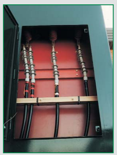
High voltage entrance